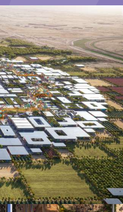
LOOP OF NATIONS