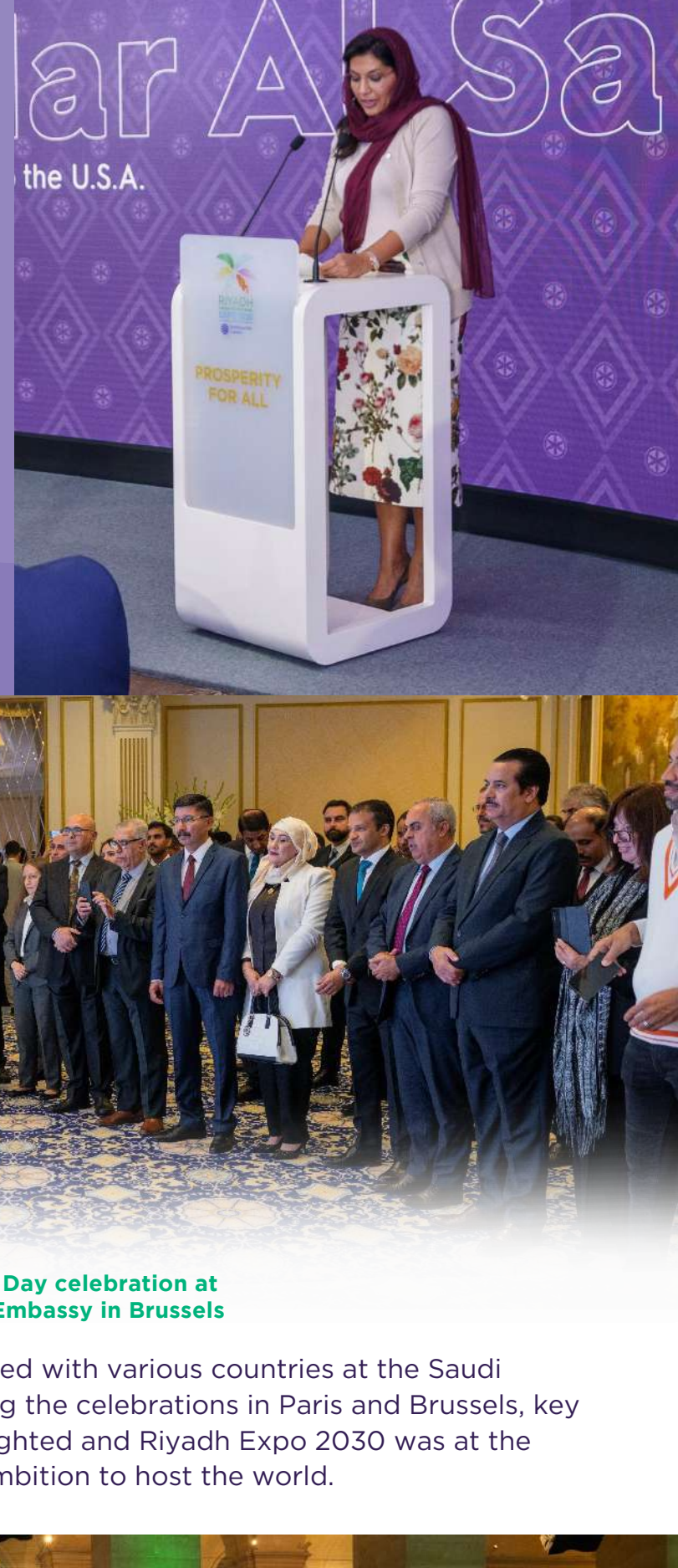
Rayyana Barnawi sharing her views for "A Different Tomorrow" at the Riyadh Expo 2030 Seminar

Barnawi has spent over nine years as a research lab technician for the Stem Cell and Tissue Re-engineering Program at King Faisal Specialist Hospital and Research Center located in Riyadh, Saudi Arabia.