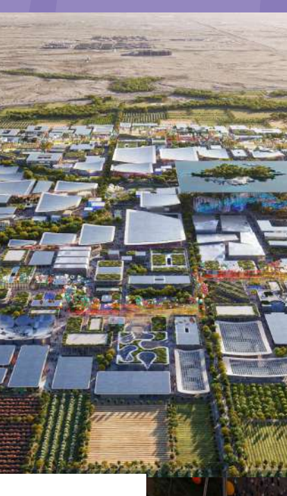
RIYADH EXPO 2030